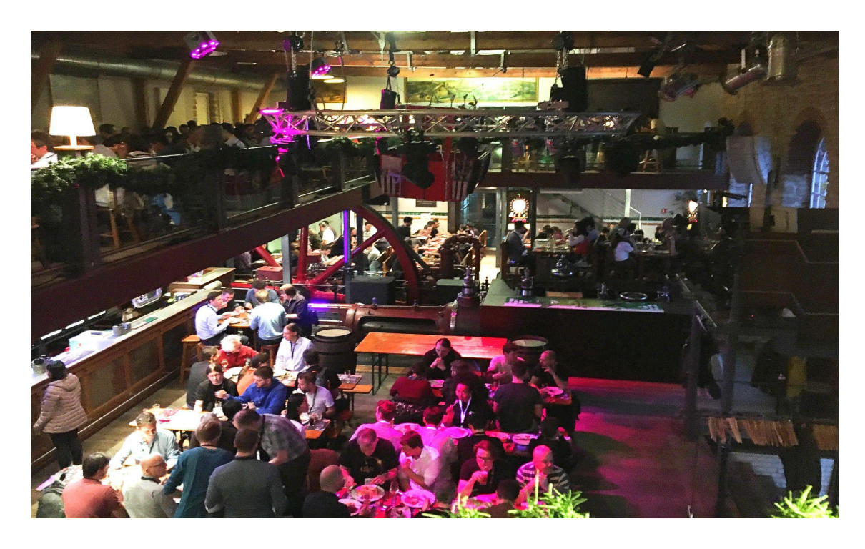
Evening welcome reception at the Big Beer Company Clausen