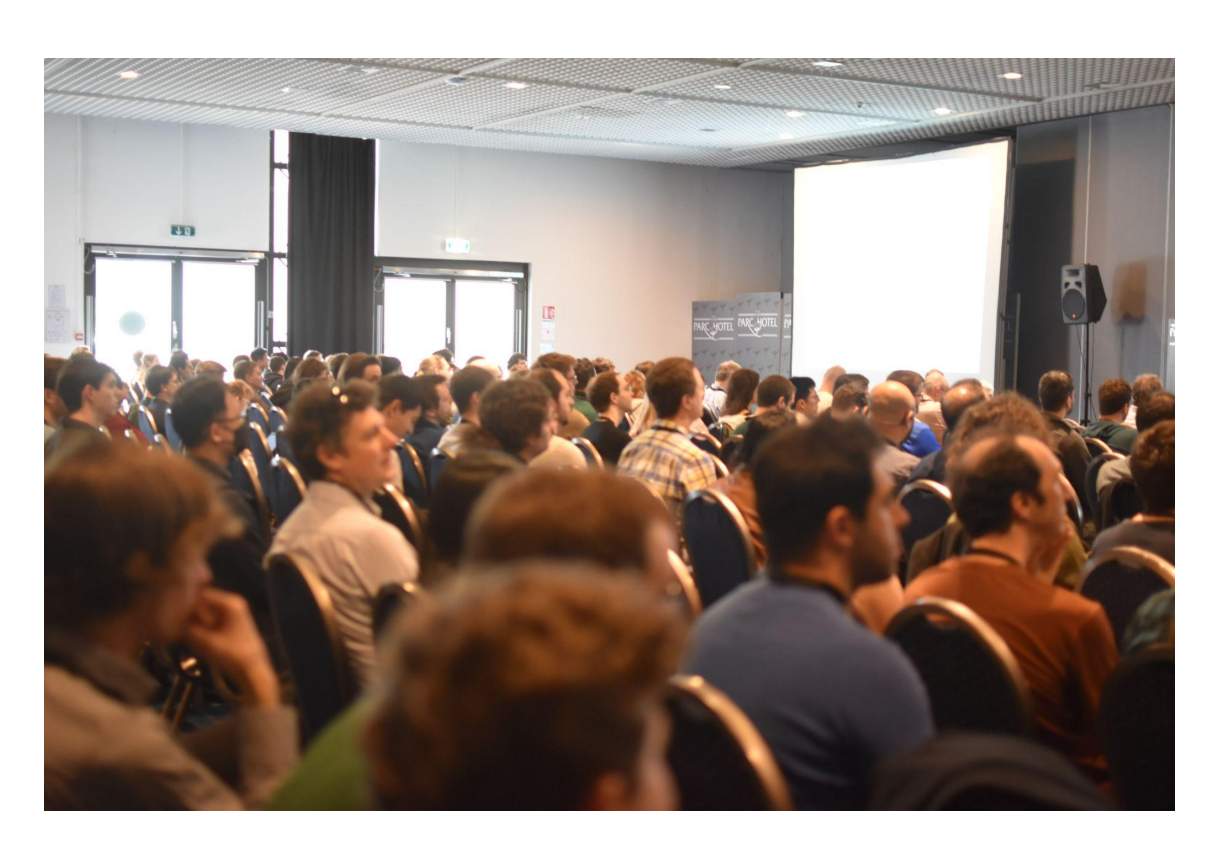
Attendees at the keynote session